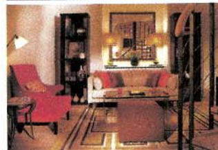
Conversion Once a monastery, the Augustine is now a top hotel